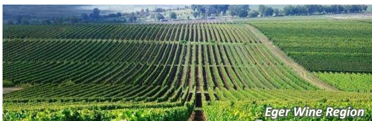
Eger Wine Region