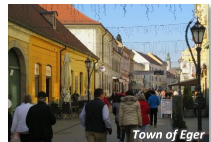
Town of Eger