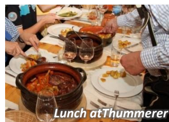
Lunch at Thummerer